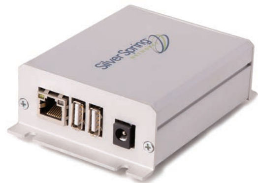
The IoT Edge Router offers standard connectivity interfaces including Ethernet, USB, and HDMI